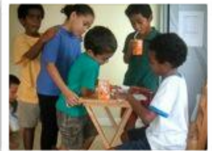
The School has a shop which is run by the more senior children to demonstrate mathematics skills in a more authentic context.

Most often identified as the skills required by 'scientists', it is however not restricted to them. To some extent the material success of 'Western' culture can be attributed to the emphasis on solving problems using logic.